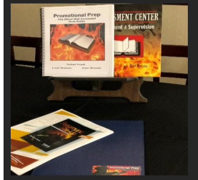
Promotional Prep's text books and workbooks